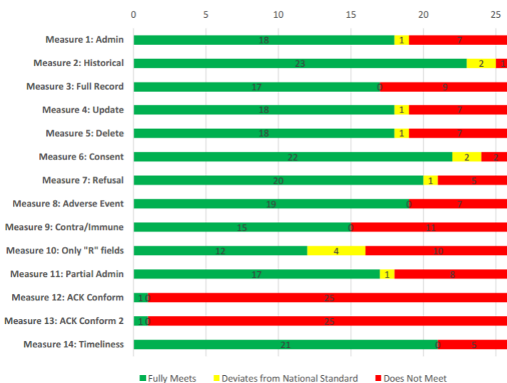
Submission and Acknowledgement Measures - Aggregate Results

57 IIS (which includes all 50 states, plus D.C., New York City, Philadelphia, Puerto Rico, San Diego, San Antonio, and the Virgin Islands) were encouraged to voluntarily participate in the IIS Assessment project. Of the 57, 28 IIS opted to participate in the January 2017 submission and acknowledgement assessment for the baseline measure.